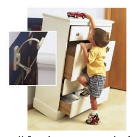
All furniture over 27-inches will be sold with safety straps to anchor furniture to the wall safely.

We will provide safety straps for your items when you drop it off at the JBF sale.