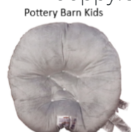
Pottery Barn Kids